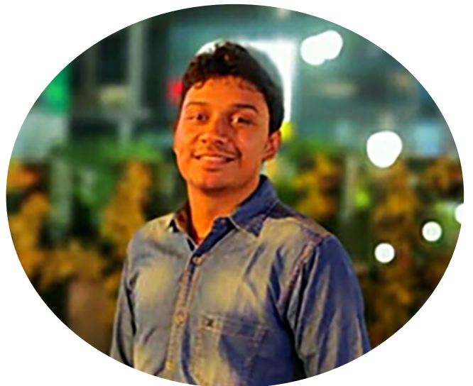
RAJA II-PGDM NOVELIST